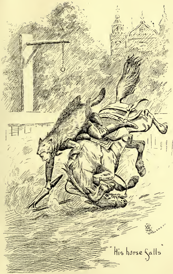
"His horse falls"